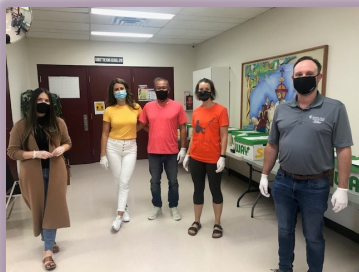
THANK YOU TO OUR FUN LUNCH VOLUNTEERS!